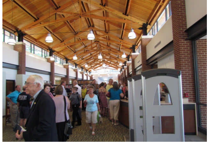
Members of the community get their first look at the new Prince George County Library on Saturday, July 23, 2011.

The Prince George County Library opened its doors on Saturday, July 23, 2011! With the help of many organizations including the WCPGC ladies, the landscaping, book sorting, tagging, scanning and shelving was completed despite the heat and a bomb scare. The opening was a huge success and the citizens of Prince George turned out to enjoy the new facility, sign up for new library cards, and check out one of the 30,000 books that were available.